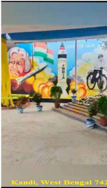
Kandi, West Bengal 742137