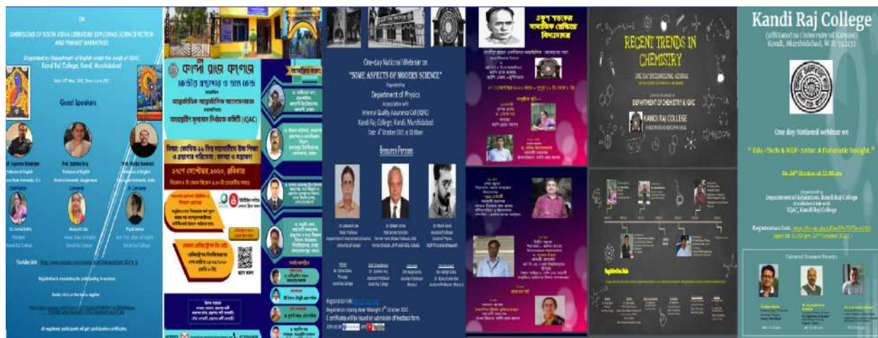
Brochure of the Webinars