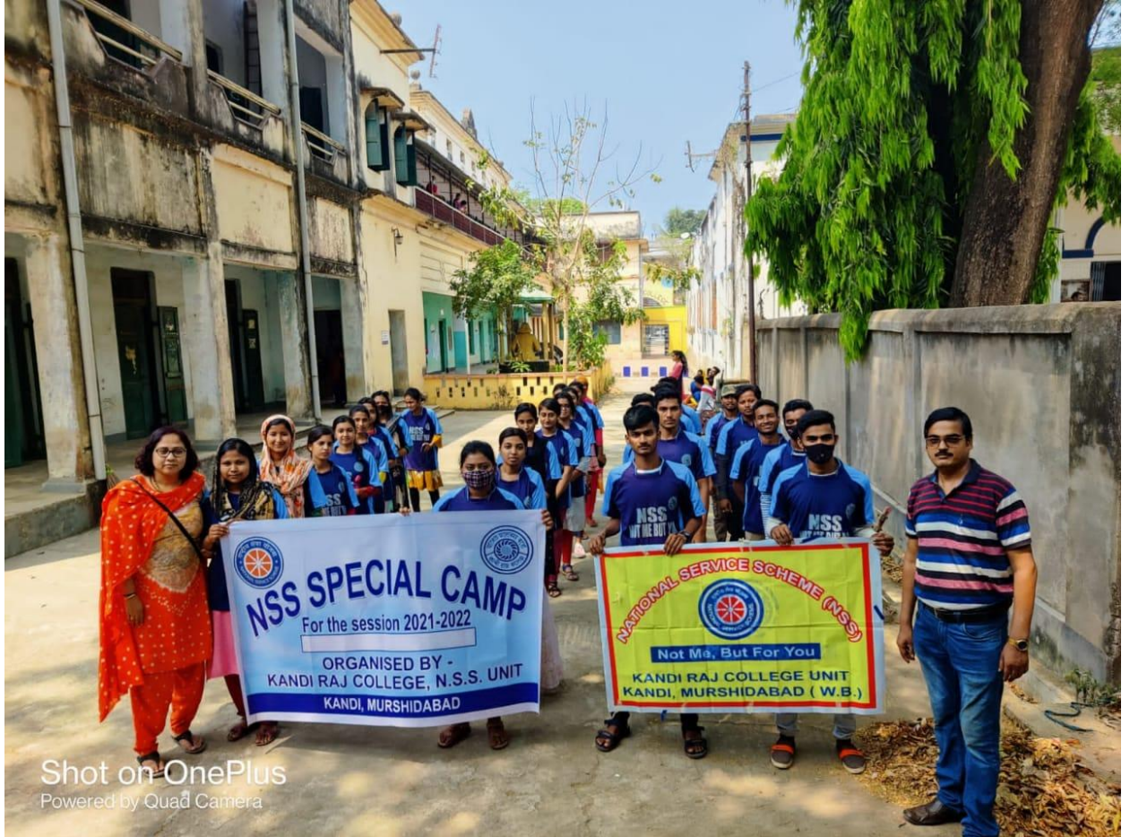
Shot on OnePlus Powered by Quad Camera